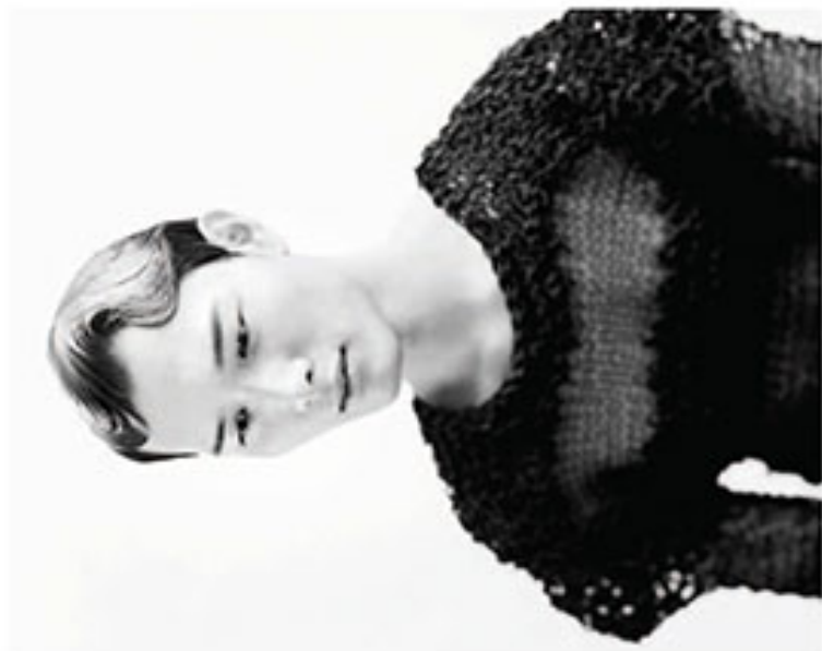
STYLING / NEHA TANUJA MODEL / FACE CHEN

ILL US WOULD YOU SINCE IS ON OF OFF PHOTOGRAPHY #WWW.LUCAMARRA.COM